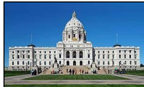
Minnesota State Capitol Building