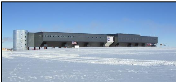
Amundsen-Scott South Pole Research Station